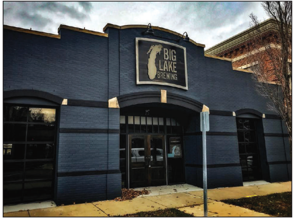
BIG LAKE BREWING

Yes, this one is a little far from our downtown area, but you'll want to know about it sooner than later. If you're not from Holland, you may have noticed that part of our charm (and maybe drawback) is our lack of major chain restaurants. However, it was only a matter of time before the town with a church on every corner acquired a Chick-fil-A. This restaurant, though a chain, is long awaited for our city. They are also participating in The First 100, in which they grant free Chick-fil-A for a year to the first 100 guests. Look forward to fried chicken and waffle fries galore on Feb. 8th, 2018.