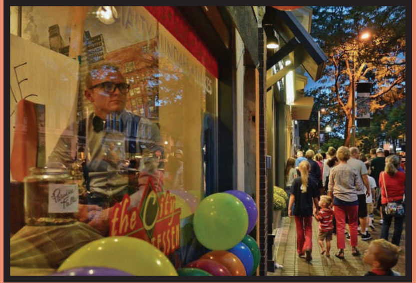
HOLLAND AREA VISITORS BUREAU

Wednesday and Saturday mornings, you can crawl out of bed to find yourself at the end of 8th street, where dozens of local farmers gather to sell fresh crops and hand-made items. The Farmer's Market is a good place to go for fresh food and even flowers. As the season changes, so do the vendors. The market begins at 8 a.m. and lasts until 3 p.m. if business is good.