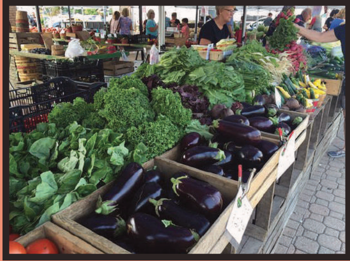
HOOLLAND FARMERS MARKET

As fall quickly approaches, Holland likes to pull out the best of the best. If you're new to Hope College or looking to experience all that this season, check out a few activities happening this month. Delve into your community of Hope and Holland. Almost all of these events are free or require very little cash to have a good time.